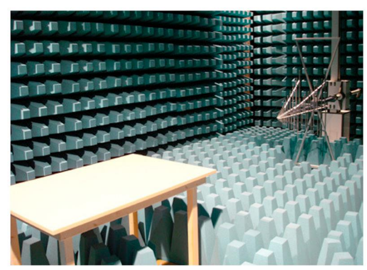
Fig. 42 – Fully anechoic chamber. The emission measurement is performed on a turntable in distance of 3 m. For diagnostic pre-investigation near field probes (E-Field probes and H-Field probes) can be used.

Emission measurements in the frequency range can be carried out on open area test sites (OATS) or in anechoic chambers. Fig. 42 shows a fully anechoic chamber for testing of frequencies up to 20 GHz. To compensate the missing tips of the absorbers the room is completely cladded with special ferrite tiles.