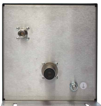
HV-AN S150, view to the EUT port