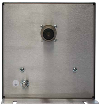
HV-AN S150, view to the AE port