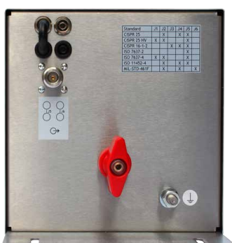
HV-AN 150, view to the EUT port