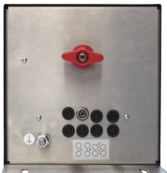
HV-AN 150, view to the AE port