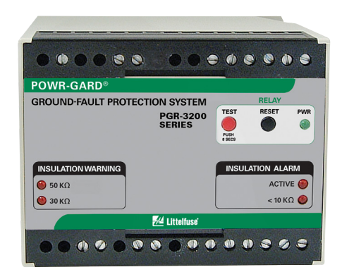
The Littelfuse POWR-GARD® PGR-3200 Insulation Monitor can be used with both ungrounded and grounded BESSs.

The SE-704 Earth-Leakage Monitor provides both feeder-level protection or individual-load protection.