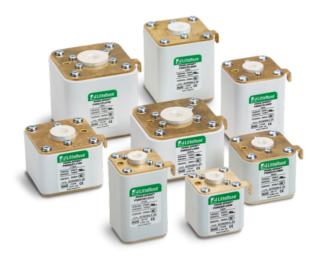
Figure 1. Littelfuse PSR Series High-Speed Square-Body Fuses are frequently used for overcurrent protection of inverters because of their compact design, fast response to short circuit fault currents, and high interrupting ratings.

High-speed fuses are designed to operate about 24 times faster than conventional fuses in order to protect sensitive power semiconductor devices (such as diodes, triacs, IGBTs, SCRs, MOSFETs and other solid-state devices) that are built into inverters, UPSs, battery management devices, and other systems by reducing peak let-through current and let-through energy (I²t).