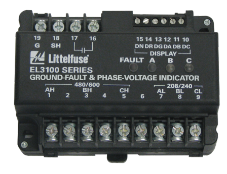
Figure 5. EL3100 Ground-Fault and Phase-Voltage Indicator can be used in conjunction with an SE-601 Series DC Ground-Fault Monitoring for

monitoring the status of a BESS's battery banks.